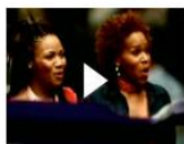
Shackles (Praise You)

Upload a 60-90 SECOND VIDEO of yourself singing one of Mary Mary's hits, Shackles (Praise You) , God In Me , or Yesterday and see if you have what it takes to steal the spotlight.